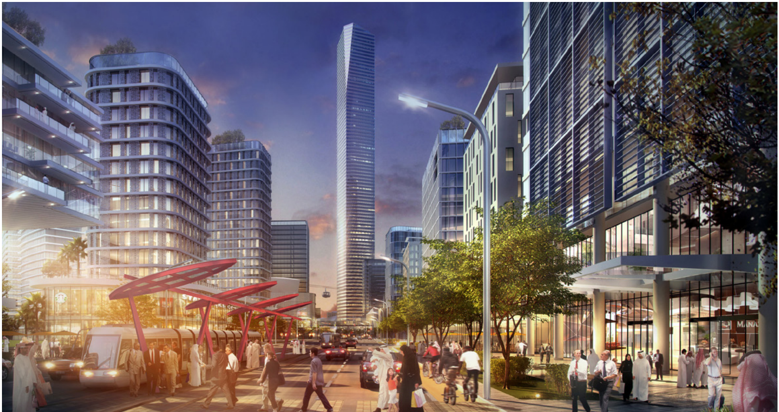
Jumeirah Central Dubai, United Arab Emirates