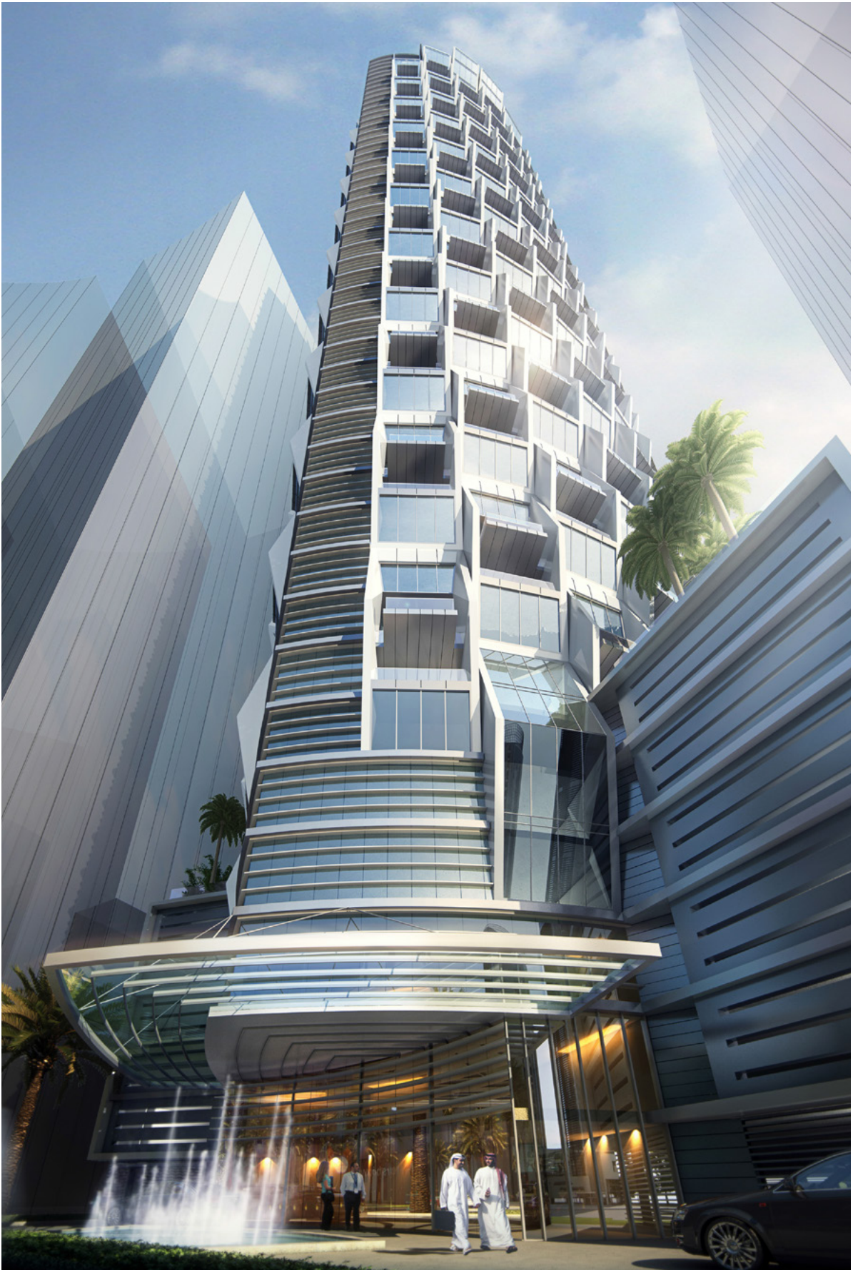
Saraya Tower Abu Dhabi, United Arab Emirates