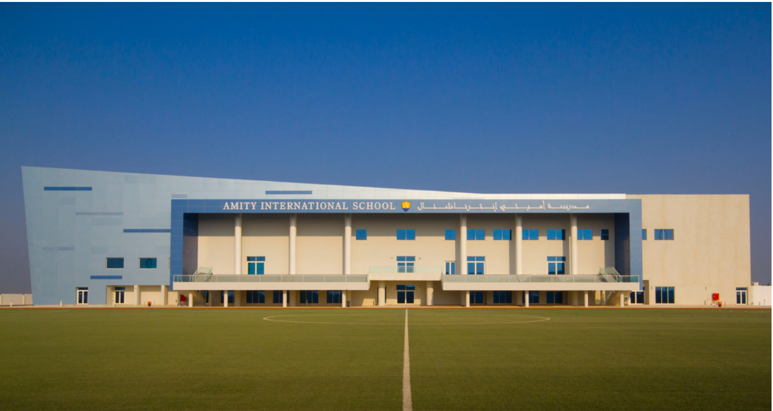
Amity Premium School Abu Dhabi, United Arab Emirates