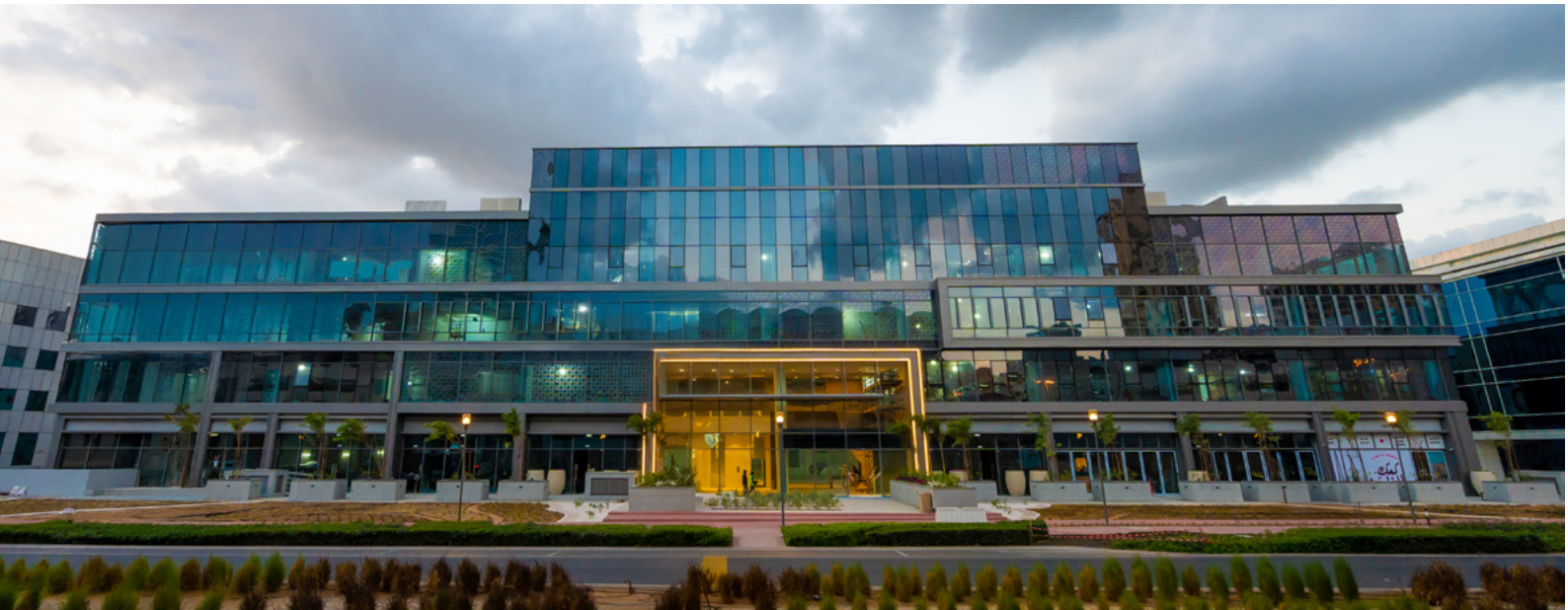
Mastercard Headquarters Dubai, United Arab Emirates