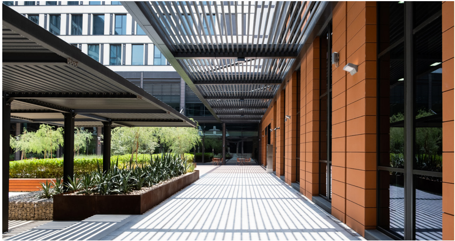
FlyDubai Headquarters Dubai, United Arab Emirates