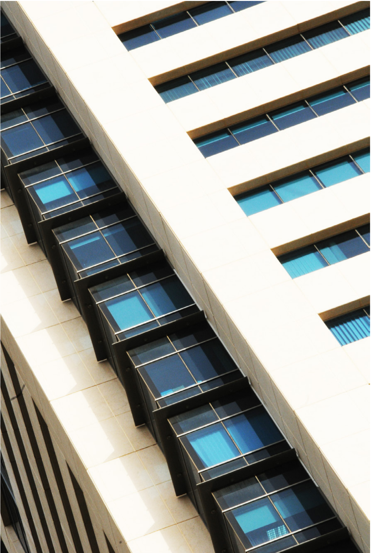
Thuraya Tower Abu Dhabi, United Arab Emirates